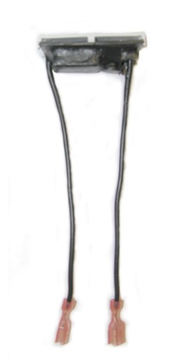
Figure 2 - 596EOL Side View