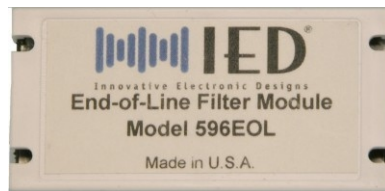
Figure 1 - 596EOL Top View